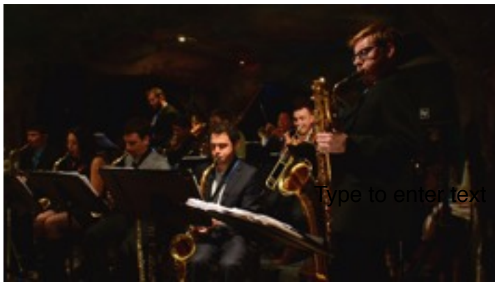
The Bohemian Caverns Big Band.