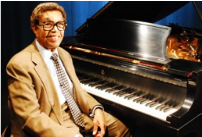
Dr. Billy Taylor on set at the Kennedy Center.