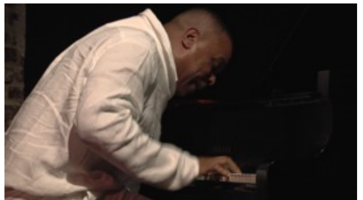
Latin Jazz Pianist Chuchito Valdes performing.