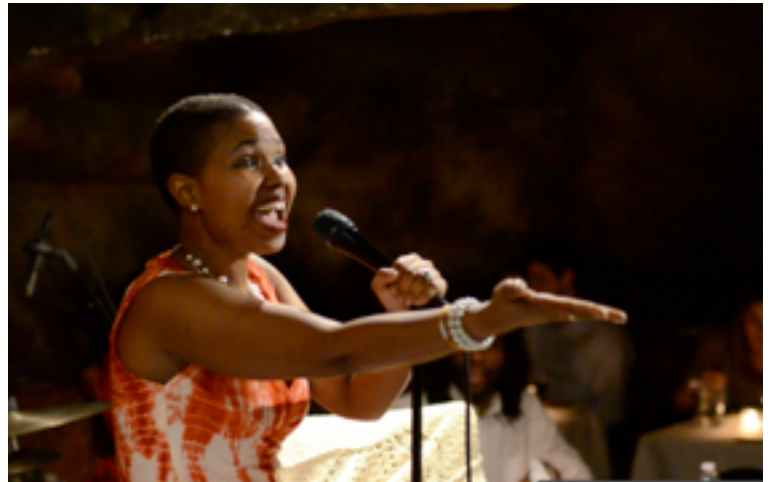
Singer Akua Allrich performing.