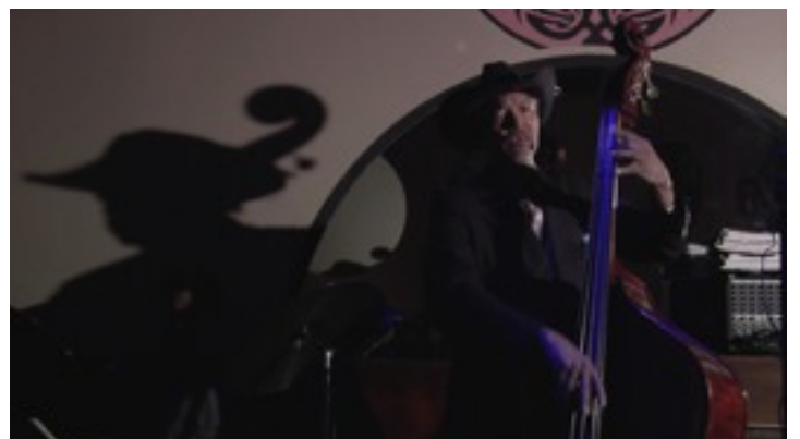
Bassist Butch Warren performing.