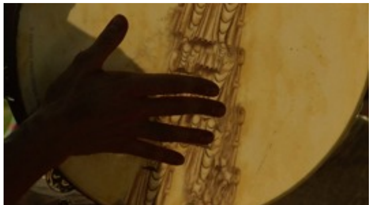
Drummer in Malcolm X Park, Washington, D.C.